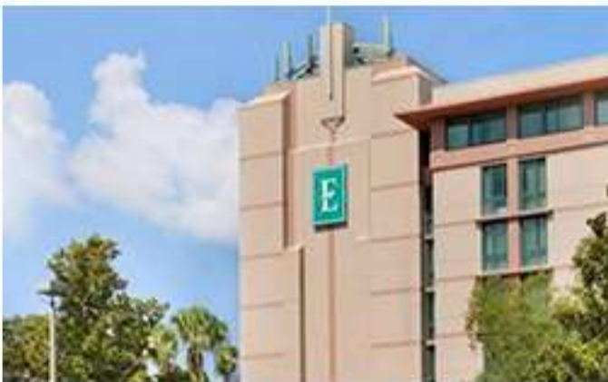
Embassy Suites in Tampa