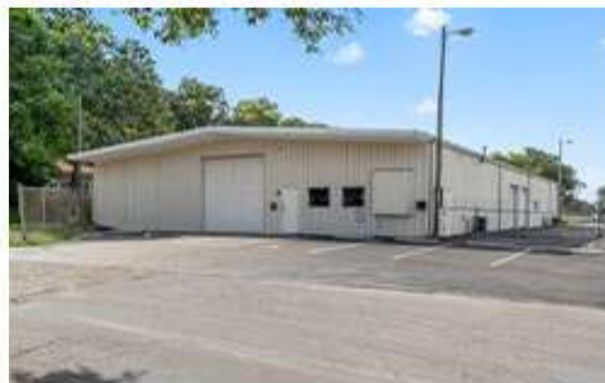
Warehouse in Dade City