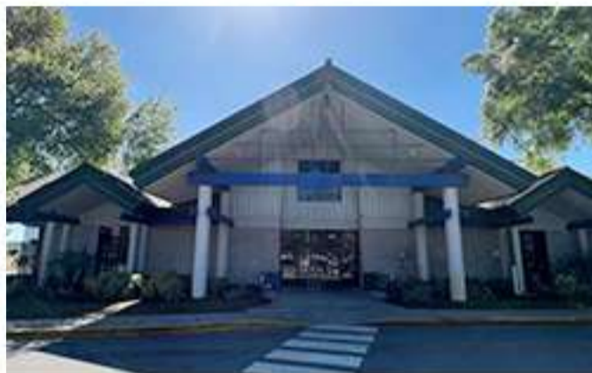
Land O' Lakes Recreation Complex