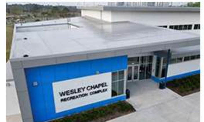
Wesley Chapel District Park