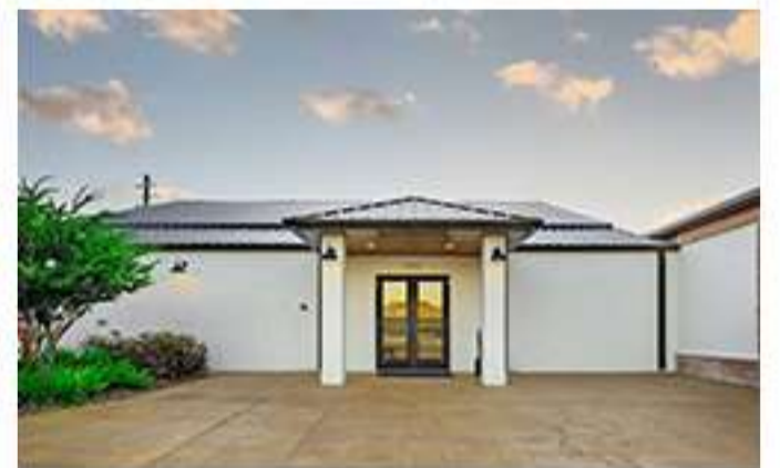
Venue At The Block in Dade City