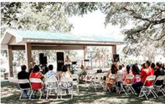
Agnes Lamb Park in Dade City